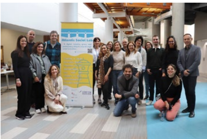
Atlantic Social Lab Partnership at Glasgow Caledonian University

The final conference of the extension phase of the ASL project took place in Glasgow on 18-19 May and was organised by Glasgow Caledonian University. The conference was integrated into the "Second Changemakers and Pioneers: Social Innovation Fair".