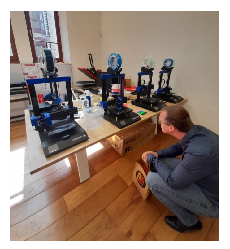
Figure 3-3D printers at the Social Innovation Center