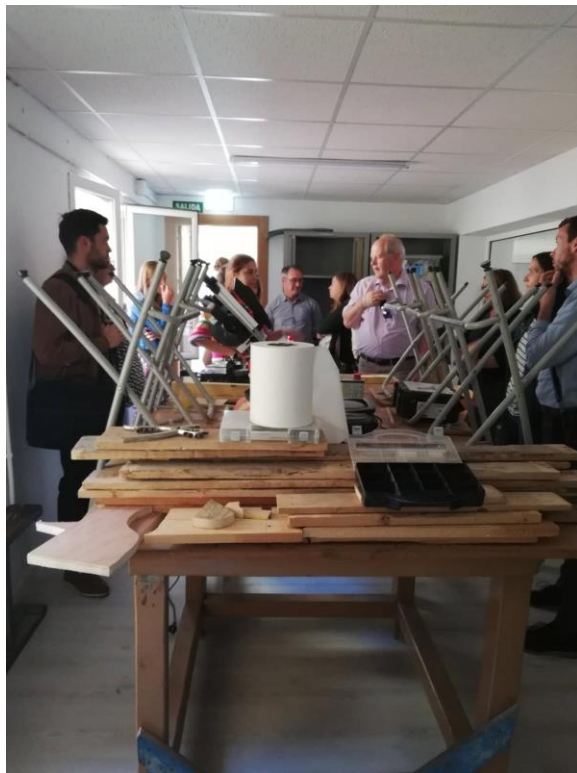
Figure 3 - Handwork Workshop Facilities