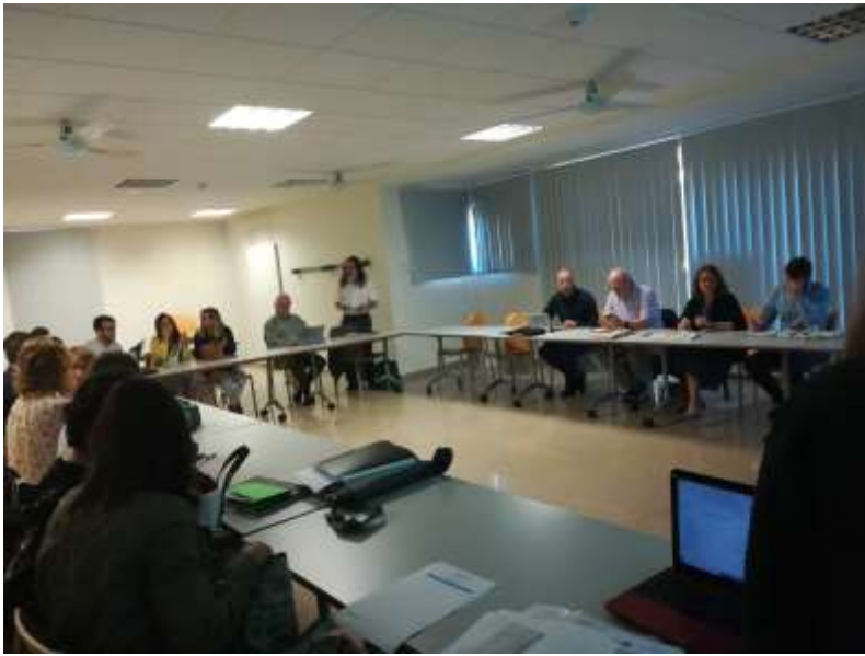
Participants at the Atlantic Social Lab Coordination Meeting in Aviles, Spain